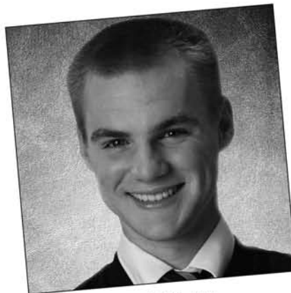
Theft Victim "Someone stole my cell phone."