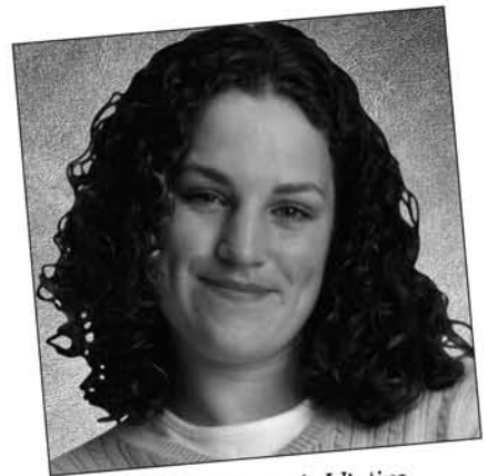
Sexual Assault Victim "I've been raped."