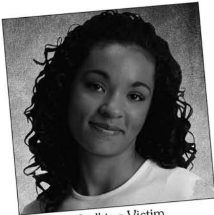
Stalking Victim "My ex-boyfriend keeps following me."