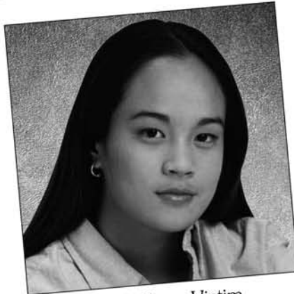
Child Abuse Victim "I get hit at home."