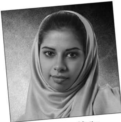
Hate Crime Victim "I'm harassed because I'm different."